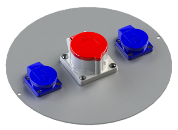
Standard center plate