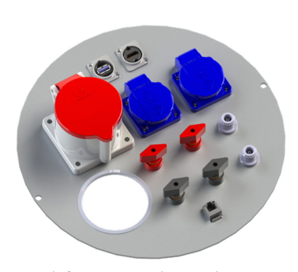
Example for a customized center plate

Information presented enclosed is subject to change as product enhancements are made regularly. Pictures included are for illustration purposes only and do not represent all possible configurations.