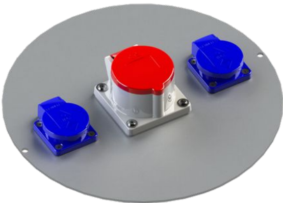
Standard center plate