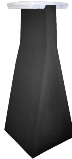
ETS-Lindgren's FS-1500H Anechoic Absorber